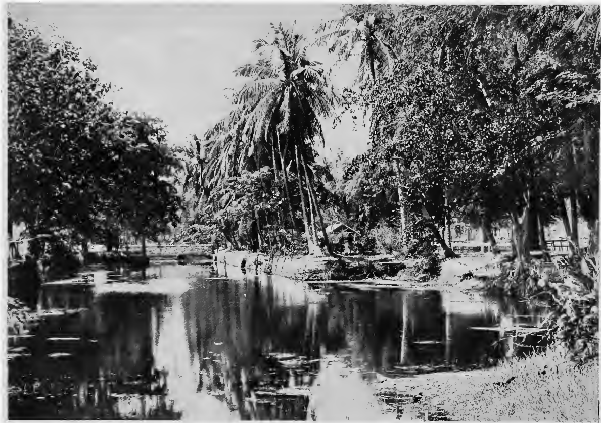
The Grotto, Fort Dufferin, Mandalay